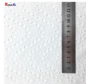
RXF0510 Plastic baby Woven Floral Cotton F...