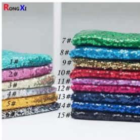
RXF0725 Sequin Mesh 3mm silver sequin fa...