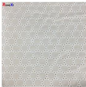
RXF0517 white 2019 cotton lace trimming e...