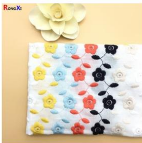
RXF0431 Hot Selling Cotton Fabric With Low...