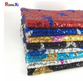
RXF0657 Brand New Geometric Sequin Fabr...