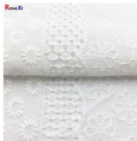
RXF0508 Professional Cotton Fabric Digital ...