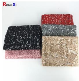
RXF0748 Brand 3mm Couble glitter Color M...