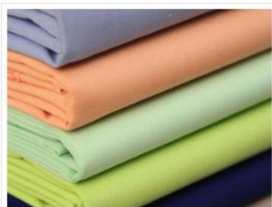
Tc Pocketing Poplin Fabric