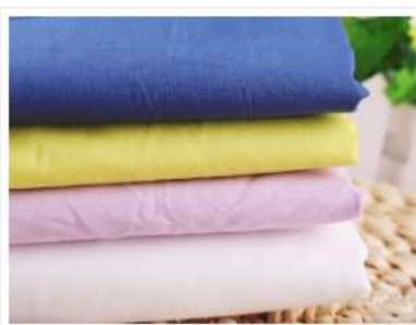
Wholesale Grey Poly Cotton Fabric