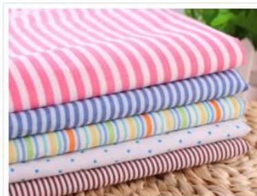
Customized Printed Fabric