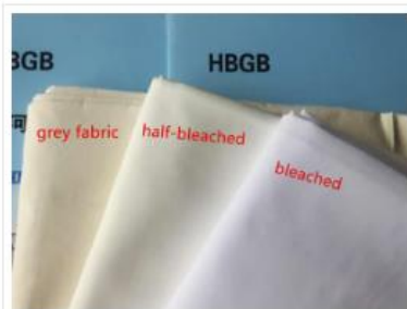
Pocket Lining Fabric Suppliers