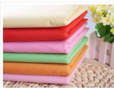
Cotton Woven Fabric Lining For Garment