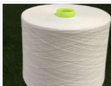
Polyester Cotton 45s Yarn