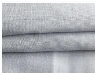
Plain Dyed Pocket Fabric Lining Fabric