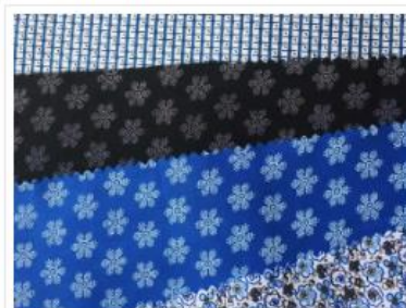
Cartoon Print Fabric