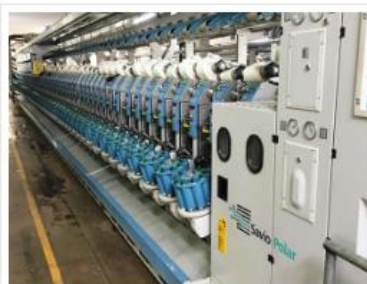
Blended Yarns For Pocket Lining Fabric