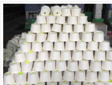
Unbleached Polyester Cotton Blended Yarn