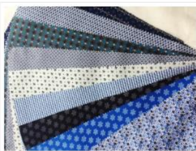
Cotton Printed Fabric