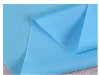
TC 45x45 Pocketing Fabric