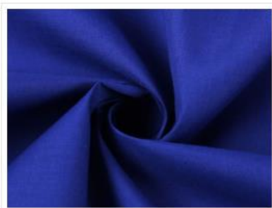
Dyed Pocketing Fabric In Stock