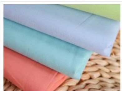
Pocket Lining Fabric For Garment