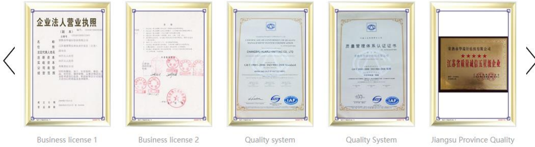
Business license 1