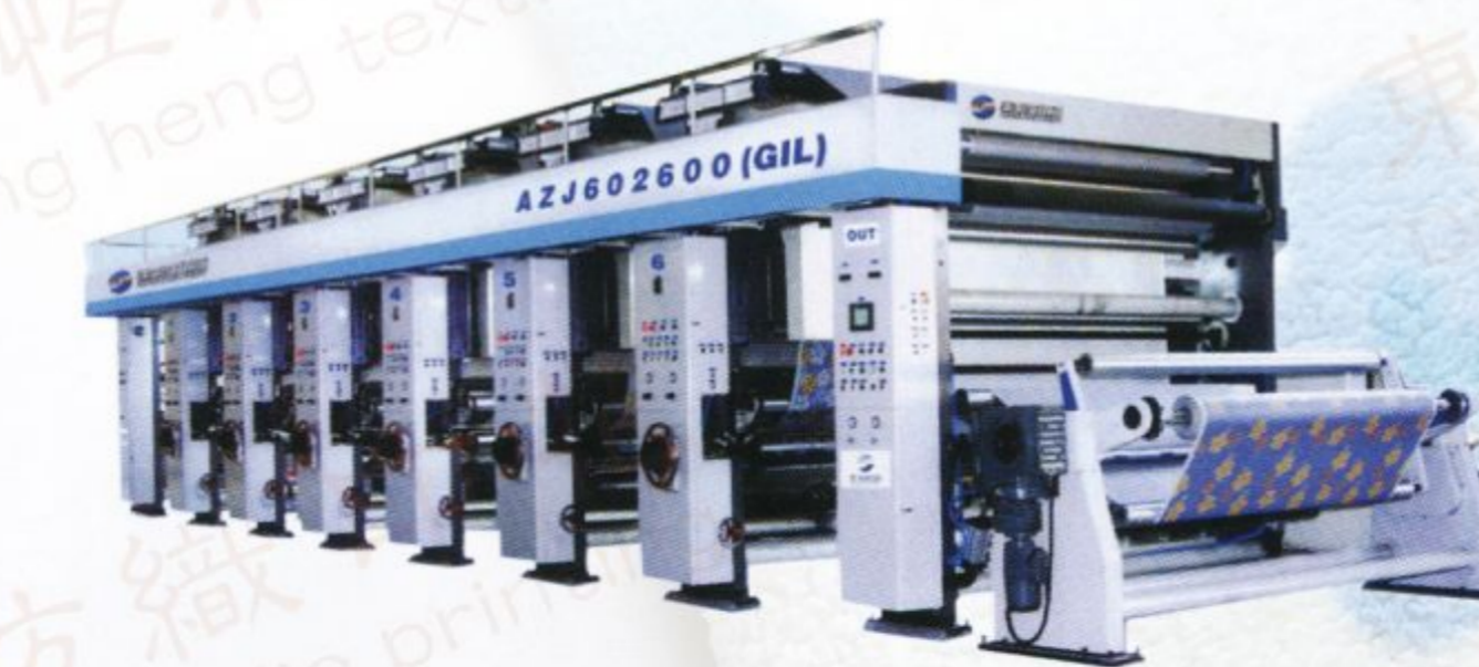
全自動高精出紙設備A Automatic high-precision paper delivery equipment A

Notes: The quotation is based on high quality ink and high quality kraft paper. MOQ:2000 m. Over 6 sets of topping color,the price will be raised for 0.3yuan/m-0.5yuan/m 300-600yuan surcharge is necessary if the quantity can not reach 2000m. The price will be decreased for 0.25yuan/m,if lower quality paper selected. Film cost:1800yuan/topping colour(pattern within 65cm The price will be raised for 0.2yuan/m each 10 cm if the width is over 150cm.