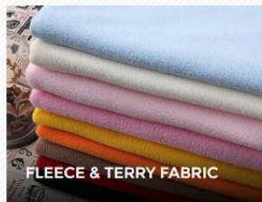
FLEECE & TERRY FABRIC