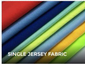
SINGLE JERSEY FABRIC