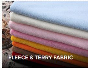
FLEECE & TERRY FABRIC