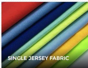
SINGLE JERSEY FABRIC