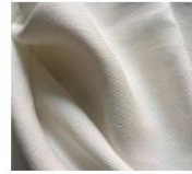
Cotton PFD Denim Fabric