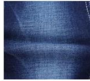
TR Stretch Denim Fabric