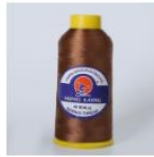
120D Variegated Embroidery Thread