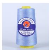
4000m Polyester Sewing Thread 40/2