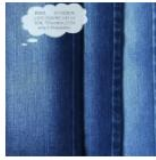
TR Stretch Denim Fabric Made In China