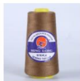
20s/3 Brown Color Jeans Sewing Thread