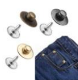
Rivets Fasteners Studs Button