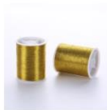
M Type Metallic Thread