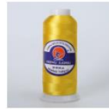
120D Rayon Embroidery Thread