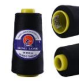
40s/2 Black Sewing Thread