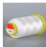
Sewing Thread For Leather