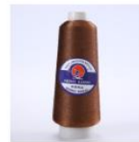
MS Type Metallic Thread