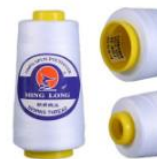
40s/2 White Sewing Thread