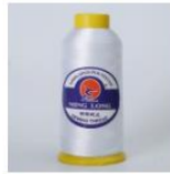
300D High Quality Polyester Embroidery...