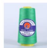
40s/2 Polyester Sewing Thread In China