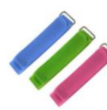
Tie Type Hook and Loop