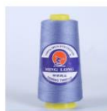
40/2 Polyester Sewing Thread Wholesale