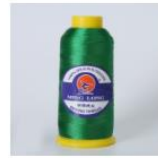
75D Polyester Embroidery Thread