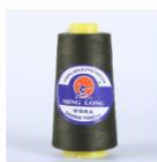
20/2 Polyester Sewing Thread For Denim