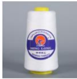
20 Degree Water Soluble Thread