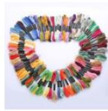
50 Mix Color Cross Stitch Thread