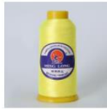
108D Dye Colors Embroidery Thread