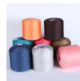
Dyed Big Cone Polyester Sewing Thread