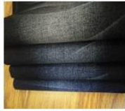
Cotton Spandex Stretch Denim