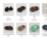
Plastic Button for Suits and Shirts