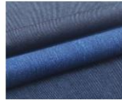
100% Cotton Denim Fabric