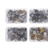
Metal Button for Jeans