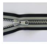
Plastic Zippers for Jackets