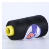
40s/2 Dark Blue Sewing Thread