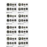
Snap Button for Jacket and Coat