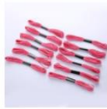
Skein Cross Stitch Embroidery Thread