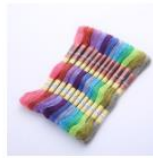
26/2*6 Cross Stitch Thread