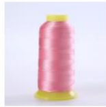
150D Multicolor Polyester Embroidery...