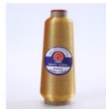
MH Type Metallic Thread