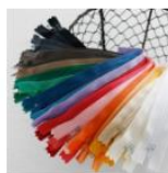
Nylon Coil Zippers