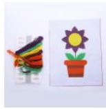
Cross Stitch Patterns For Kids