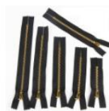
Metal Zippers for Jeans