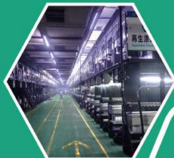
4 再生纺丝生产线 Recycled spinning line