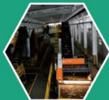
2 全自动清洗线 Bottle washing line