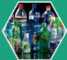
1 再生聚酯瓶 Post-consumer PET bottles