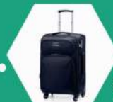
箱包面料 Luggage fabric