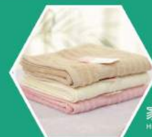
家纺面料 Home textile fabric