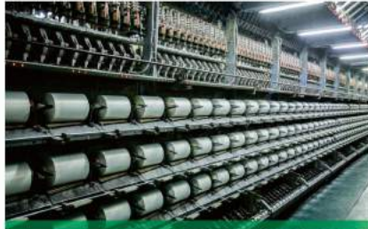
再生涤纶生产线 Regenerated polyester production line