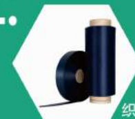
织带面料 Label/Ribbon Fabrics