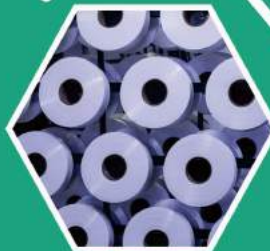
5 再生涤纶长丝 Recycled polyester yarns