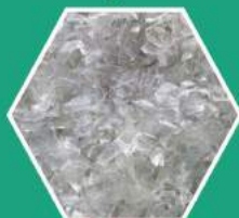
3 深度净化瓶片 瓶片切片 Fiberment grade flakes Bottle chips