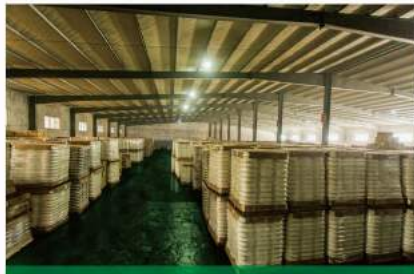
再生涤纶仓储 Recycled Polyester Storage