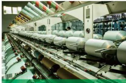
再生涤纶生产线 Regenerated polyester production line