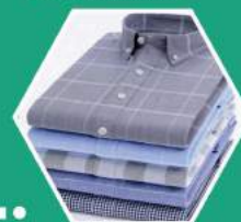
6 各类衍生产品 Downstream products