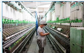
6 Spun yarn