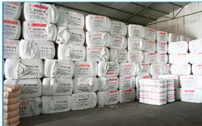
1 The raw material pretreatment