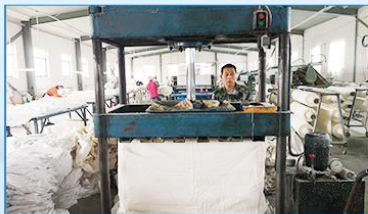
6 Grey fabric