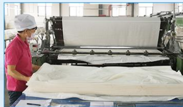
5 Fabric inspection