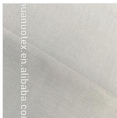
wholesales chian supplier tencel co...