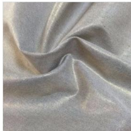
China 100% cotton spandex fabric tw...