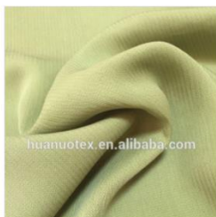
Comfortable soft tencel woven fabri...