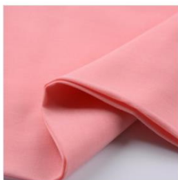
China supplier wholesale cheap visc...