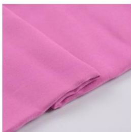
Hot selling cheap price wholesale c...