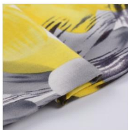
wholesale cheap viscose high densit...