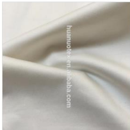
China supplier wholesale cotton sat...