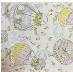
wholesales china supplier tencel wo...