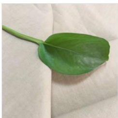
China supplier cotton tencel blend ...