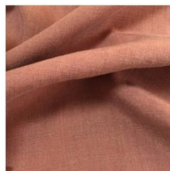
Hot selling china supplier tencel w...