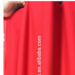
Cotton Nylon Spandex twill shirt fa...