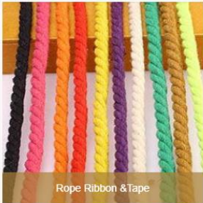
Rope Ribbon & Tape