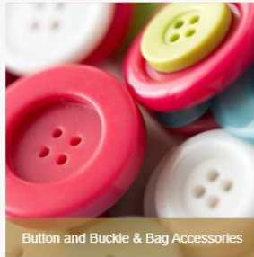
Button and Buckle & Bag Accessories