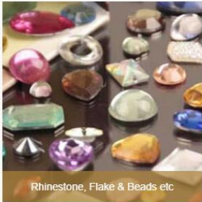
Rhinestone, Flake & Beads etc