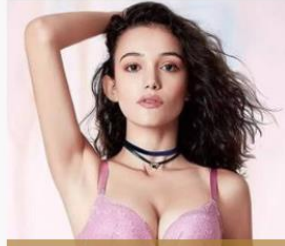
Accessories for Underwear & Wedding