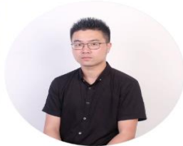
DING Quality Controller