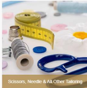
Scissors, Needle & All Other Tailoring