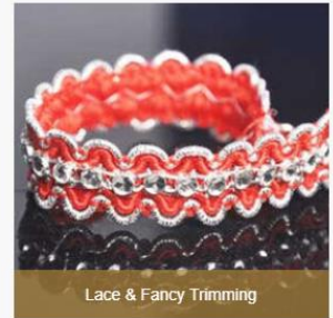
Lace & Fancy Trimming