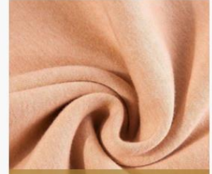
Fabric, Interlining & Lining