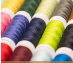
All kinds of thread