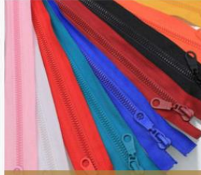
Zipper & Slider