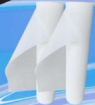
white ink film 白墨膜