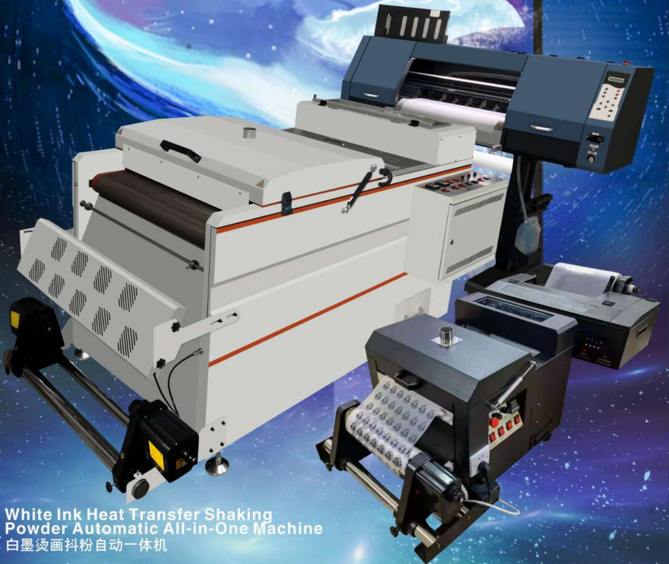
White Ink Heat Transfer Shaking Powder Automatic All-in-One Machine 白墨烫画抖粉自动一体机