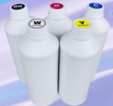
white ink 白墨墨水