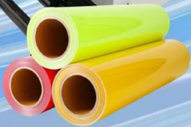
PU lettering film Pu刻字膜