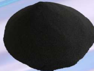
black hot melt powder 黑色热熔粉