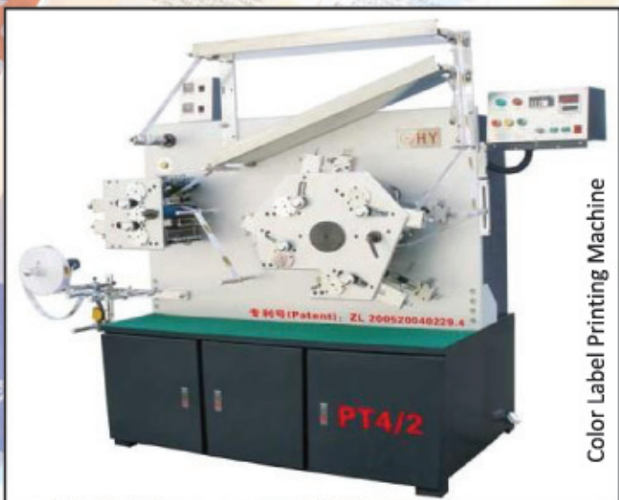
Color Label Printing Machine