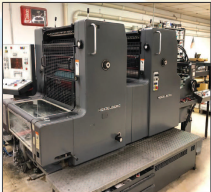
By Color Printing Machine