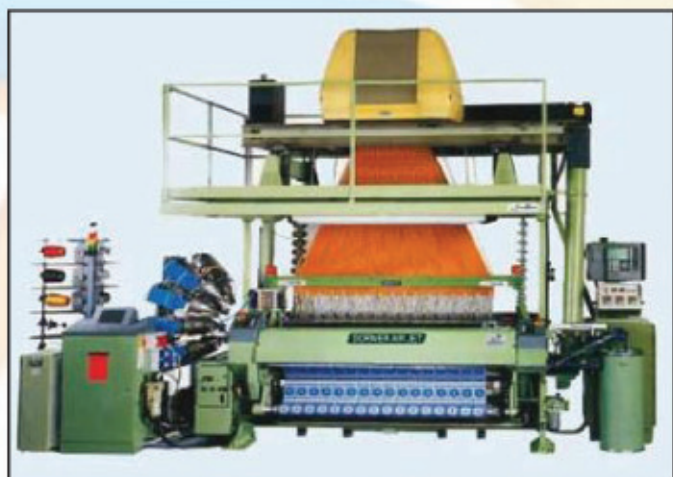
Dornier Air-Jet Loom